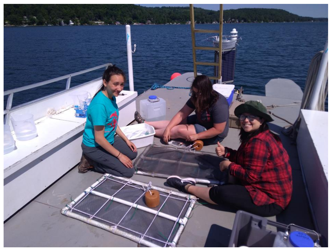
SUNY Oneonta students and an international summer intern setting up the microcosm experiment.

Having access to high-frequency water quality and weather data greatly facilitates lake modeling. NYEDEC's Nine Element Plan includes modeling of the Otsego Lake watershed and the lake itself, using the Chesapeake Assessment Scenario Tool (CAST) model by the Chesapeake Bay Program and a modified CE-QUAL-W2 model by the Upstate Freshwater Institute.