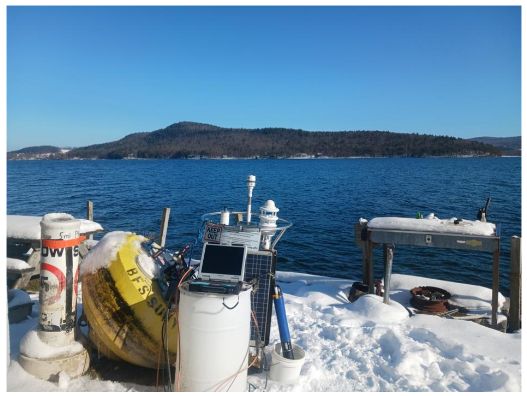
Testing the whole system with the new Airmar weather station.

After the nutrient load reduction is achieved, the actual chlorophyll concentrations will be compared to the predicted values to assess the effectiveness of the project. This model-based approach allows more comprehensive and data-driven protection of natural resources.